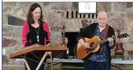
Simple Gifts- Live In Concert 4/22