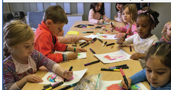
Preschool Storytime, Crafting 4/17

Be sure to RSVP for future Parkland programs.