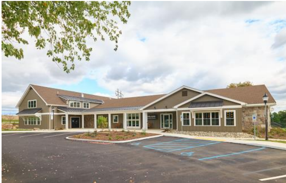
Parkland Community Library A Place of Possibilities